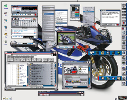
A fully skinned system...